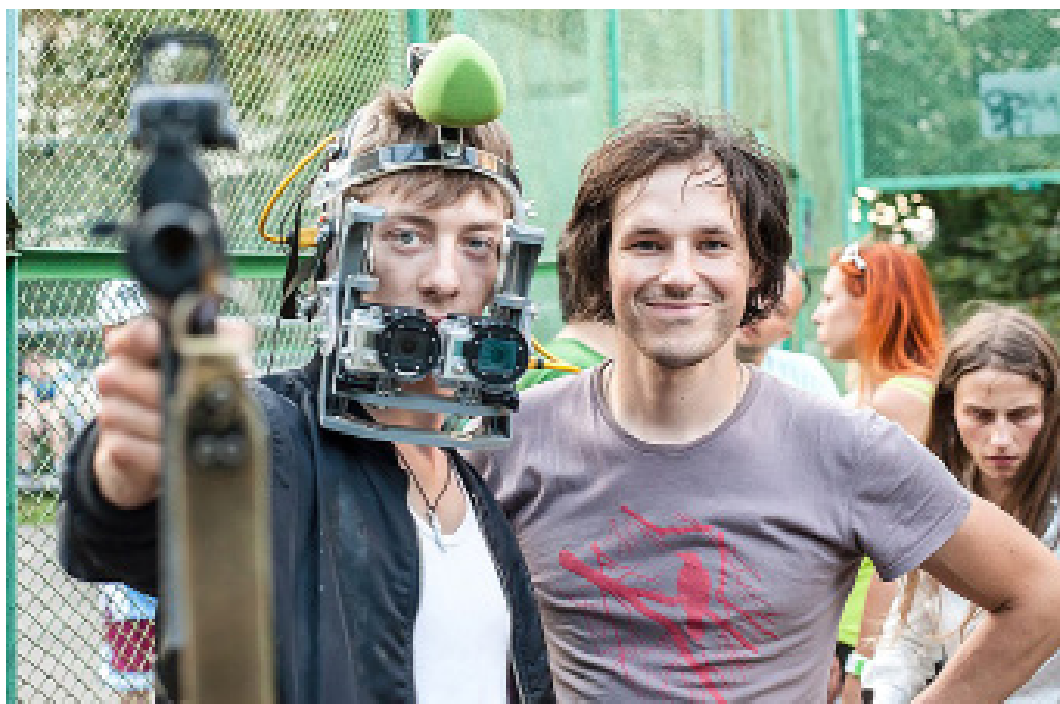
Fig. 2 The Go-Pro camera rig used to shoot the first person perspective of the movie "Hardcore Henry" directed by Ilya Naishuller (2015).

plete enveloping of vision. Observing a panorama meant immersing oneself inside the painting and being isolated from the outside world because it was no longer possible to find the limits or frame of that representation. Similarly, the first nineteenth-century dioramas were able to introduce sophis-