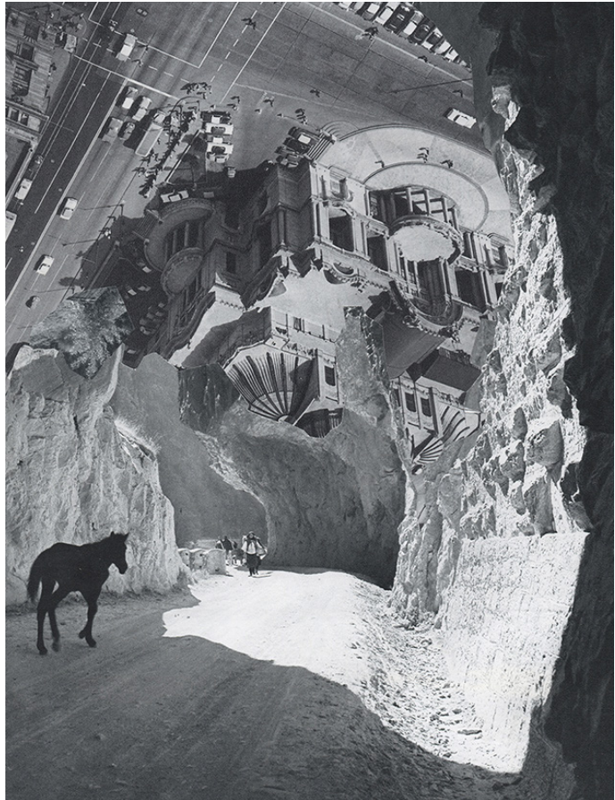
Fig. 2 Sabine Hertig, Untitled , 2012, analogue collage on paper, 27 x 20 cm.

nel roof from which cliff formations hang, whereas focussing on the urban landscape makes the mountain road appear to be a spatial element reaching towards the sky. In this example the 'seeing as' is crucially achieved by the formal qualities of the photographic images which allow one part of the picture to relate to the other in a meaningful fashion. The urban