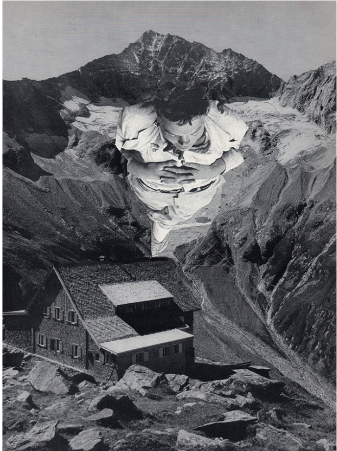
Fig. 1 Sabine Hertig, Untitled , 2010, analogue collage on paper, 24.5 x 18 cm.

scheme that would unite figure and context. Examining the collage, it strikes us that we can focus on either the landscape or the person, but we are not in a position to consider both images equally or simultaneously. Depending on our focus, either the person in white becomes a glacier, or the mountain hut becomes an abstract element that stands apart from the background of the recumbent figure. In this tilting tolerance of 'seeing as' a phenomenon can be identified that is decisive for our imaginative capacity (Wittgenstein, 1984). As a viewer, I experience how something seemingly familiar – a mountain landscape or a recumbent figure – can be seen as something else. The collage mentioned thus enables an aesthetic experi-