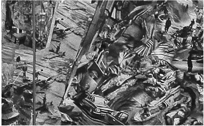
Fig. 4 Sabine Hertig, detail from Landscape 14, 2017, analogue collage on canvas.