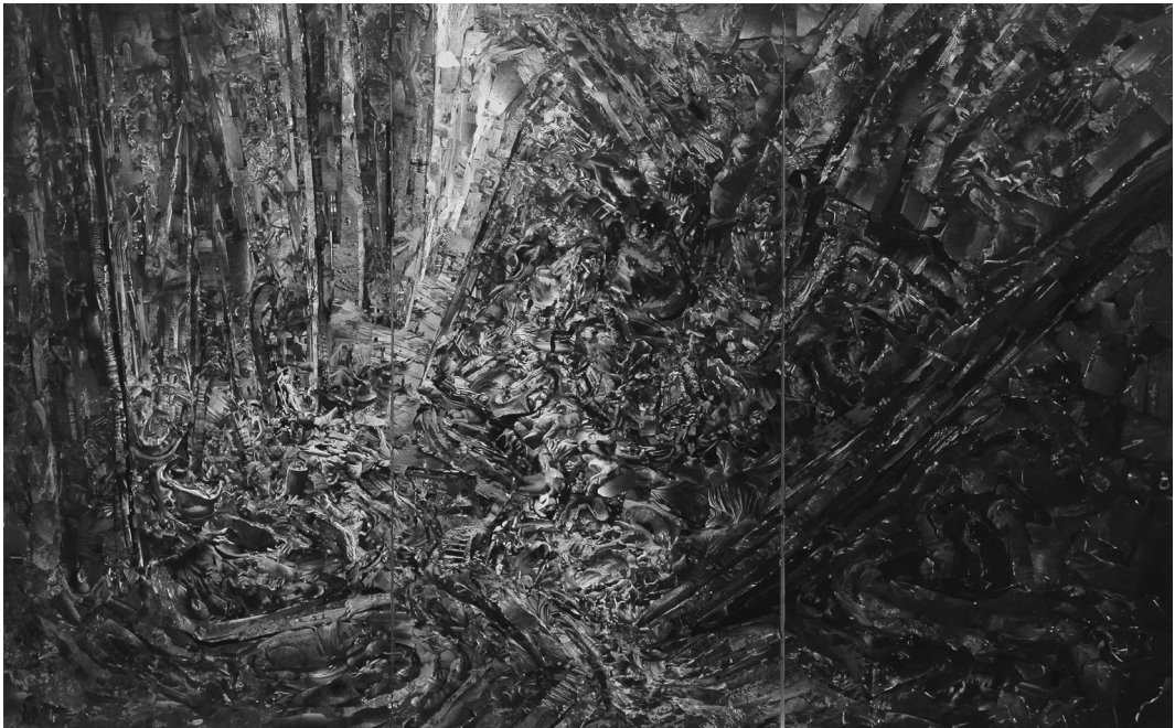
Fig. 5 Sabine Hertig, Landscape 14 , analogue collage on canvas, three vertical sections, overall dimensions 300 x 465, 2017.