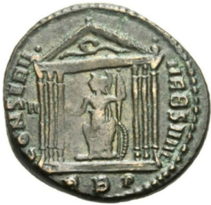
Fig. 1 Roman imperial coin of the age of Maxentius, verso (307-312 A.D.).