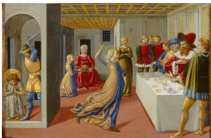
Fig. 4 Benozzo Gozzoli, Danza di Salome , 1461-1462 (Washington, National Gallery of Art).

In the Sposalizio della Vergine ( Marriage of the Virgin ) by Pietro Vannucci (1501-1504), the ceremony actually takes place