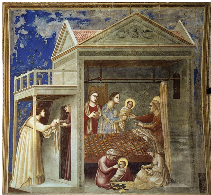
Fig. 2 Giotto da Bondone, Natività di Maria , 1303-1305 (Padova, Cappella degli Scrovegni).

Upon closer examination, proleptic abstraction distinguishes much of the history of classical art: from the Haterii