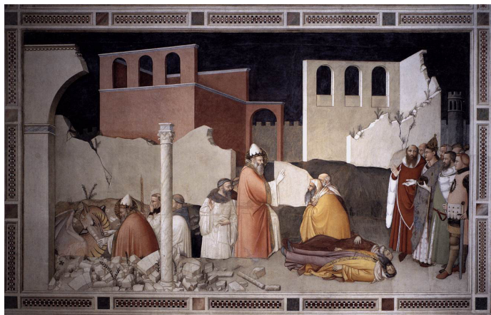
Fig. 3 Maso di Banco, Miracolo di San Silvestro , c.1340 (Firenze, Chiesa di Santa Croce, Cappella Bardi di Vernio).

In the Ultima cena ( Last Supper ) by Pietro Lorenzetti (1310-1320), viewers can glimpse the servants feeding left-over food to the domestic animals in the kitchen by virtue of the contrived transparent wall.